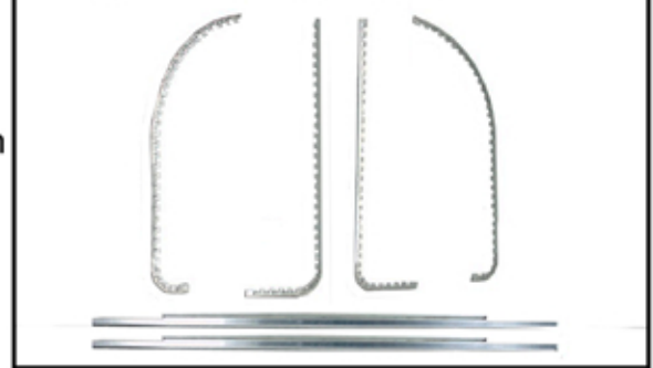
316 - Door Panel Metal Bands 12338 and 12339 Not Shown