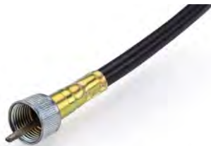
GM Thread On Cable 5/8" - 130048-36