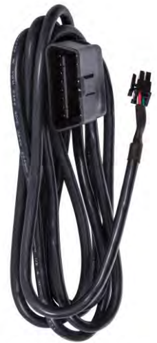
OBDII Adapter Harness - 130063