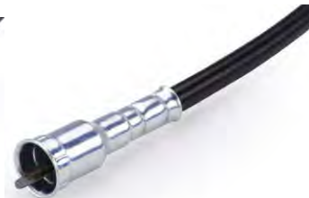
GM Clip On Cable 130049-36