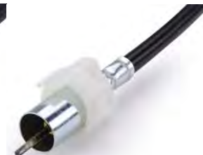
Ford Clip On Cable 130050-36