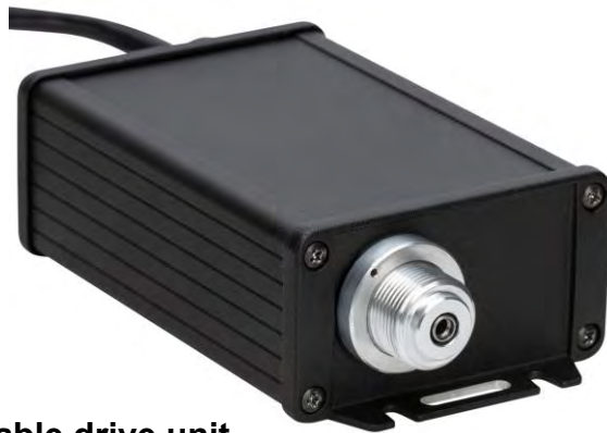
Cable drive unit