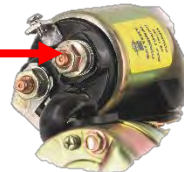
BATTERY + ON STARTER SOLENOID

NOTE: If you would like to retain the charge indicator light when converting from External regulator. See part number #150 for a plug and play DN to SI series adapter.