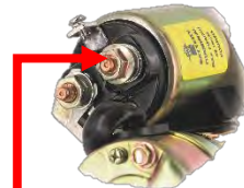
BATTERY + OR BATTERY + ON STARTER SOLENOID

NOTE: If you would like to retain the charge indicator light when converting from External regulator. See part number #150 for a plug and play DN to SI series adapter.