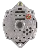
GM 10SI Internally Regulated