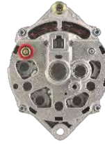
GM 10DN Externally Regulated