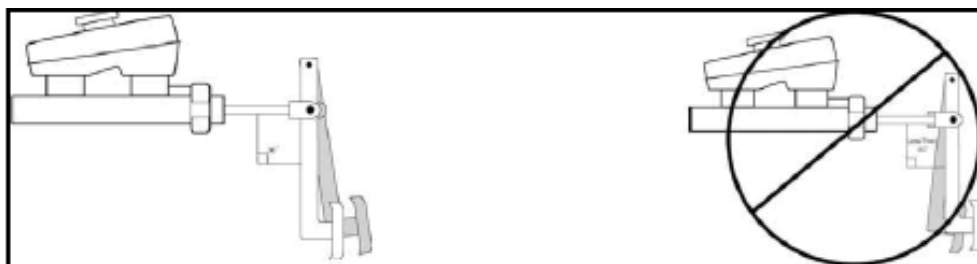
Correct pedal travel

The drawing on the left illustrates proper release and applied travel. The drawing on the right shows the pedal traveling past 90 degrees. Adjust the pedal length to prevent travel past 90 degrees.