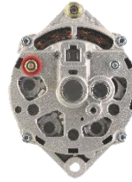
GM 10DN Externally Regulated