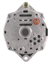
GM 10SI Internally Regulated