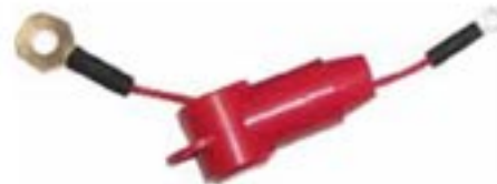
Disconnect power wire routing