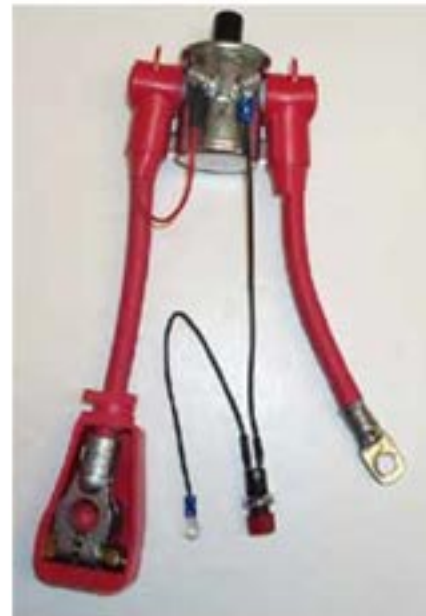
Example of completed kit.