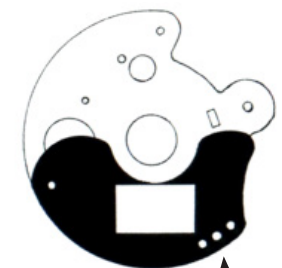
Condenser screw hole